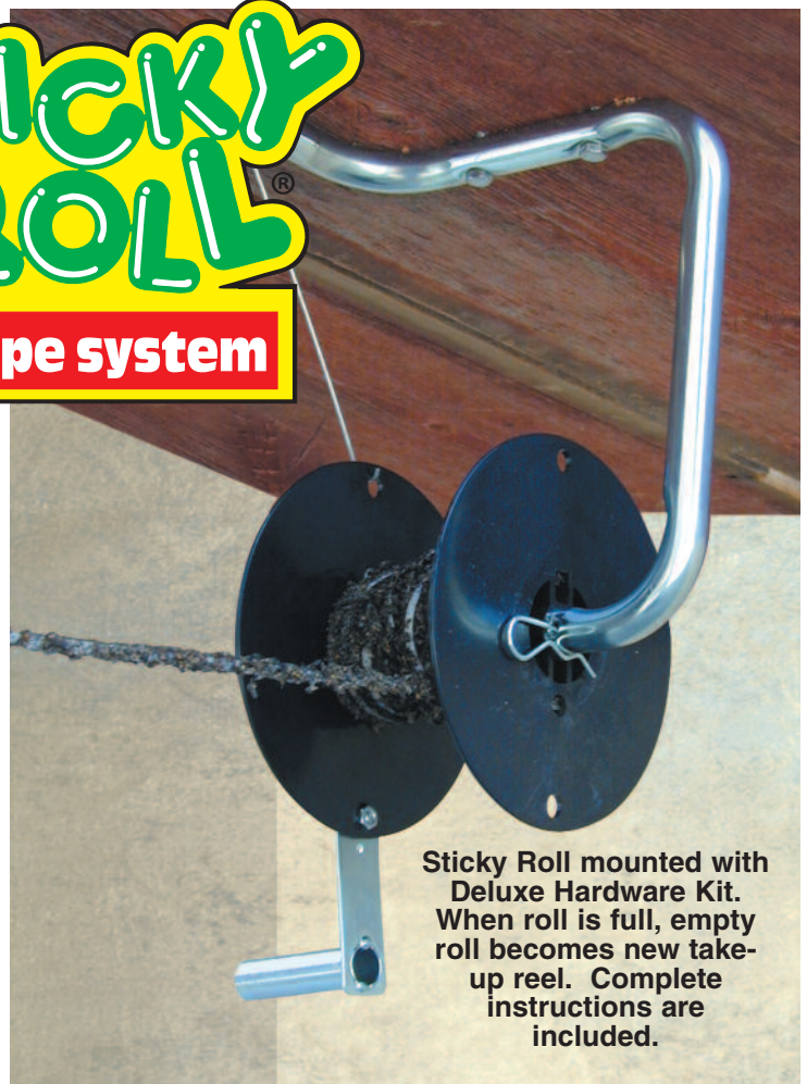
Sticky Roll mounted with Deluxe Hardware Kit. When roll is full, empty roll becomes new take-up reel. Complete instructions are included.

Safe, effective, non-toxic Sticky Roll has an unlimited range of uses in any covered area where flies are a problem, including stables, dairy barns, swine and poultry enclosures, and animal premises of all kinds. Sticky Roll is also recommended for use in zoos, kennels, refuse areas, bakeries, canneries and factories.